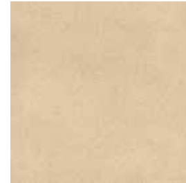
sabbia 532 reverse lay