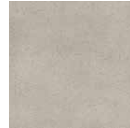
sabbia 592 reverse lay