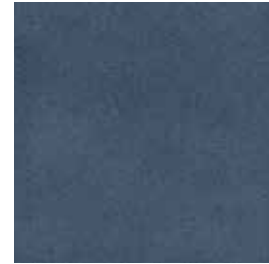
sabbia 578 reverse lay