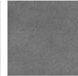
sabbia 597 reverse lay